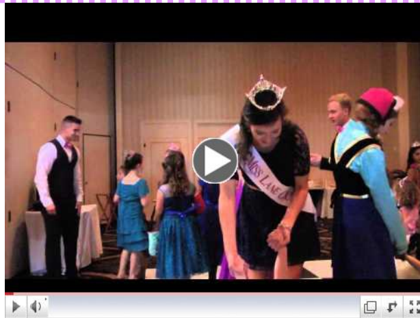
Princess For A Day 2016 Recap

event on April 8th or Set Up for the event on April 9th in the morning? Email: events@afamilyforeverychild.org for more information.