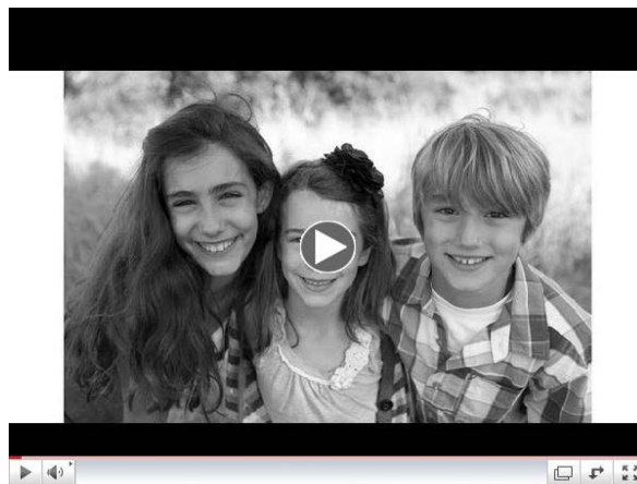
Thank you to our Volunteers