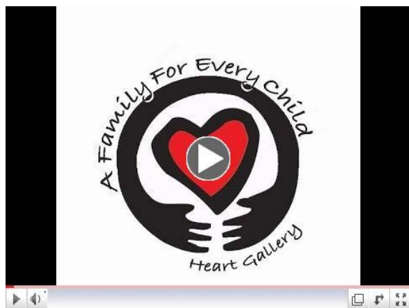
Change the world one child at a time!

A Family For Every Child 1675 W 11th Avenue Eugene, Oregon 97402 info@afamilyforeverychild.com Phone: 541-343-2856 Toll-Free: 877-343-2856