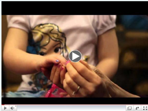
Princess for a day Event 2014

Join us for just for some of these fun activities Real Fire Truck, Equipment & Inflatable Fire Truck Slide Mad Scientist Station with Static Electricity Obstacle Courses with University Athletes Super Hero Photo Booth Fishing Lessons provided by Cabala's Hero Accessory Station