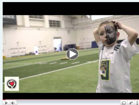
Hero for A Day 2014

Mark your calendars for February 15th from 12-3 pm for A Family For Every Child's 2nd Annual Hero for a Day Event. Located at the Moshofsky Center, (located near the University of Oregon Football Stadium) this special day is an opportunity for Oregon boys ages 2-18 to be treated like a Hero for a Day. Teaming up with local Heroes, the event is designed to be a gift for children in foster care, in addition to raising awareness of the foster care system.