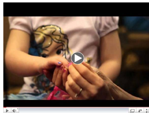
AFFEC Princess For A Day Event 2014

20,000 is the average number of children who age out of the