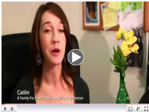
A Family For Every Child -How we, together change the numbers

12,000 children are living in the foster care system just in Oregon!