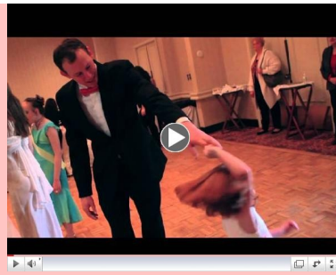
Watch a Video From Last Years Princess For A Day Event 2012

The Princess gets a gown to take home, a crown and slippers too. She has her hair and nails done, a photo shoot, and a tea party. The parent, guardian, or foster parent who brings the Princess will also have lunch as her royal guest! Foster children are admitted free. General admission for other princesses is $50.00. Advanced registration is required for all girls.